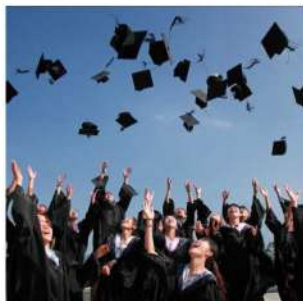
Research of Higher Education Institutions in Georgia

Audit and consulting company AGIC conducted research on authorized higher education institutions in Georgia. Methodology The data in the study is taken from the website of the Reporting Portal, which provides financial and management reports of